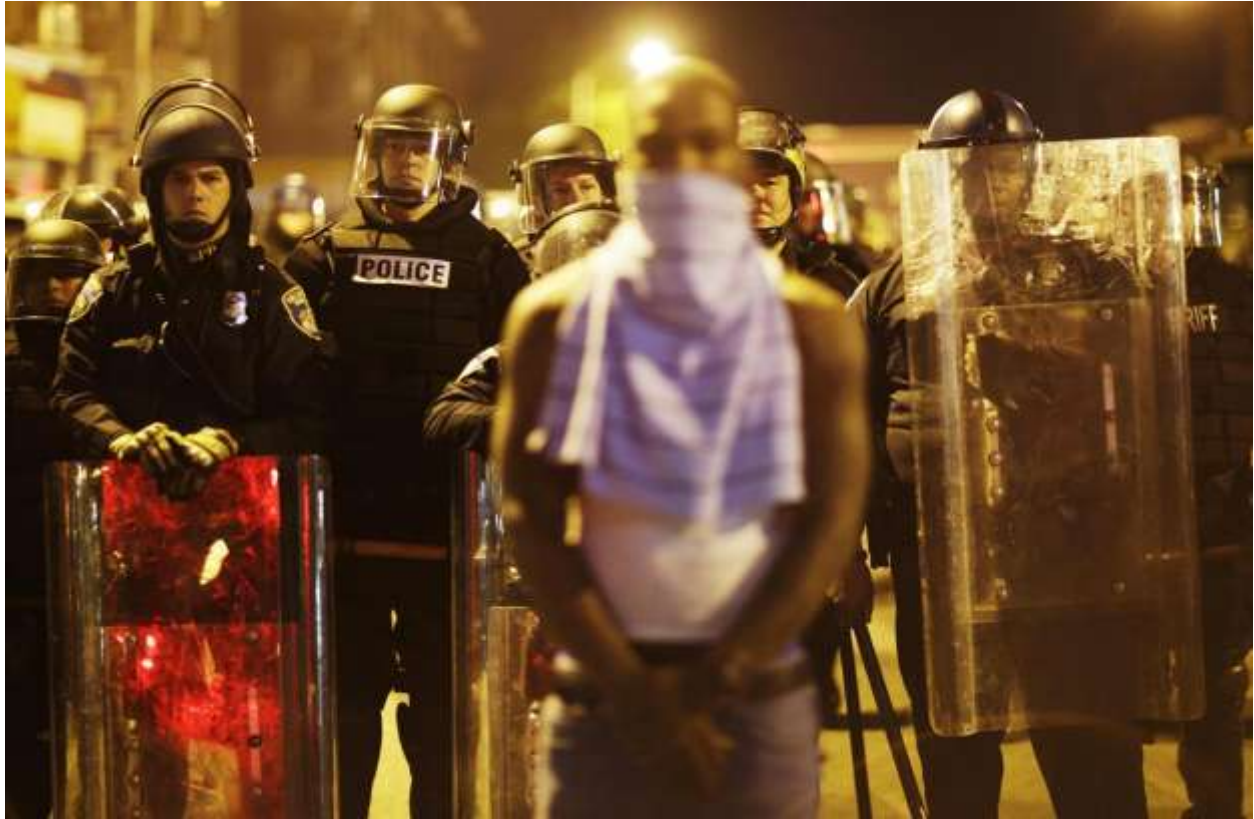
Boston – Could this be the result of mood control?