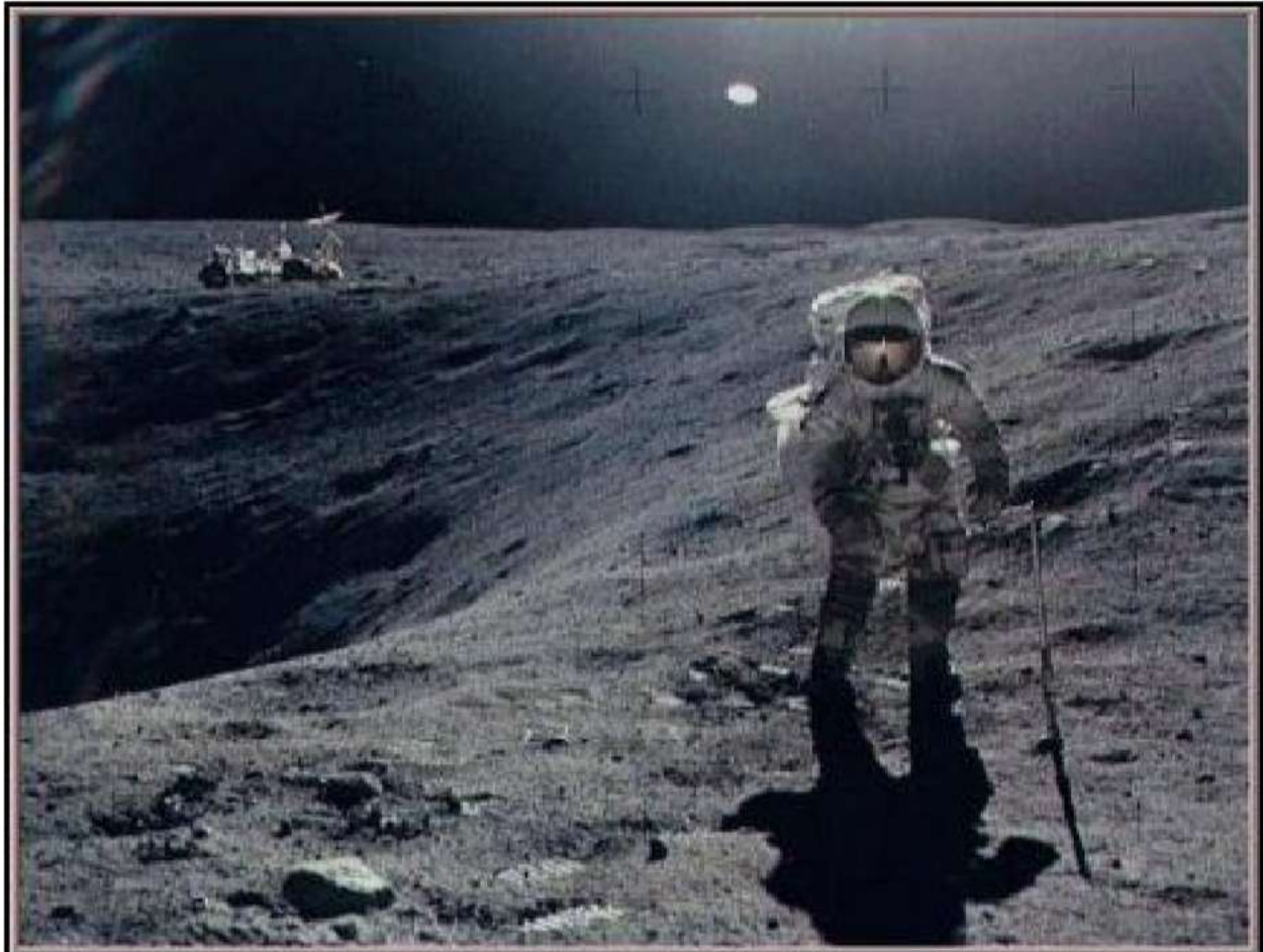
1972, Apollo 16, Moon

Classified photo taken by Apollo 16 astronaut in 1972