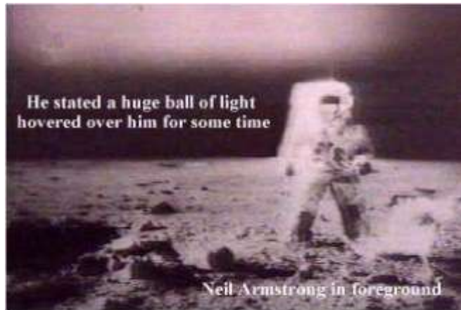
Classified photo of Neil Armstrong, taken by "Buzz" Aldrin, 1969.