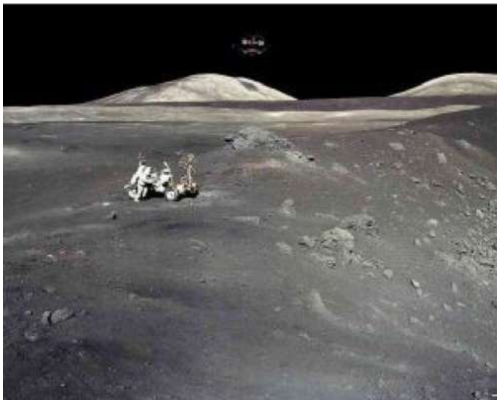
Apollo 11 Mission in 1969