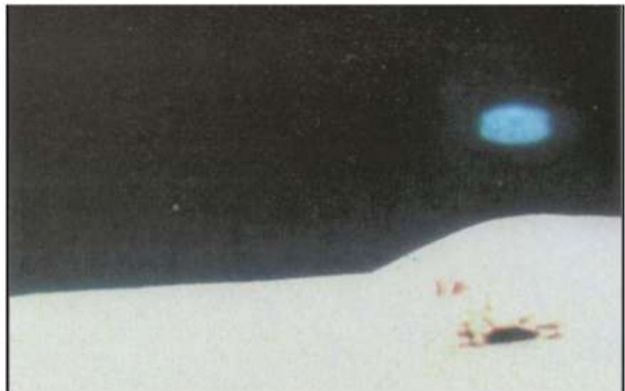
Above & below left. Classified photos taken by Apollo 15 astronauts in 1971.