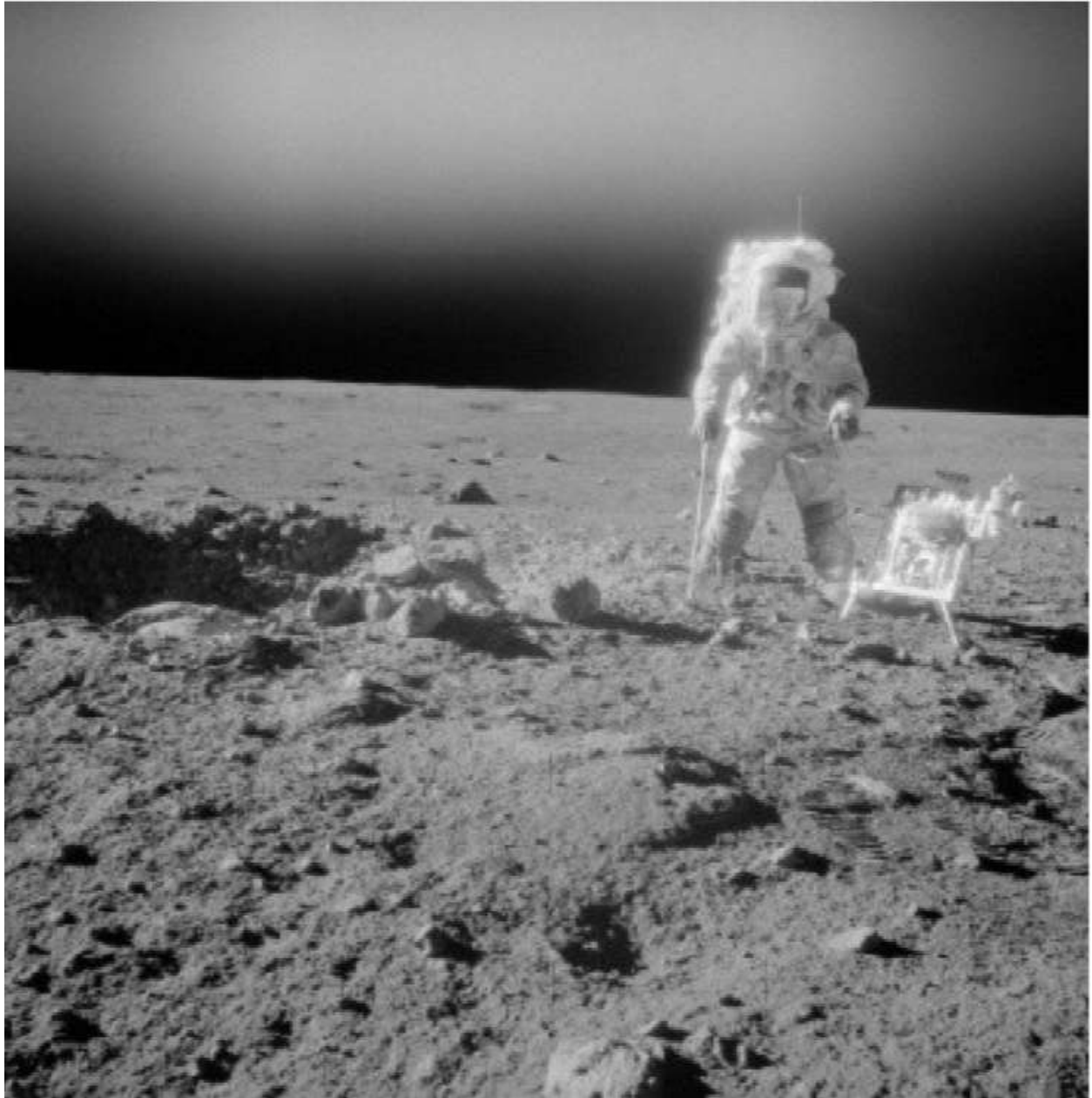
Classified photo of Neil Armstrong, taken by "Buzz" Aldrin, 1969.