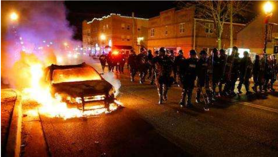
NYC or LAX – could this be more mood control?

Transmitters used no longer exist, but the technology does.