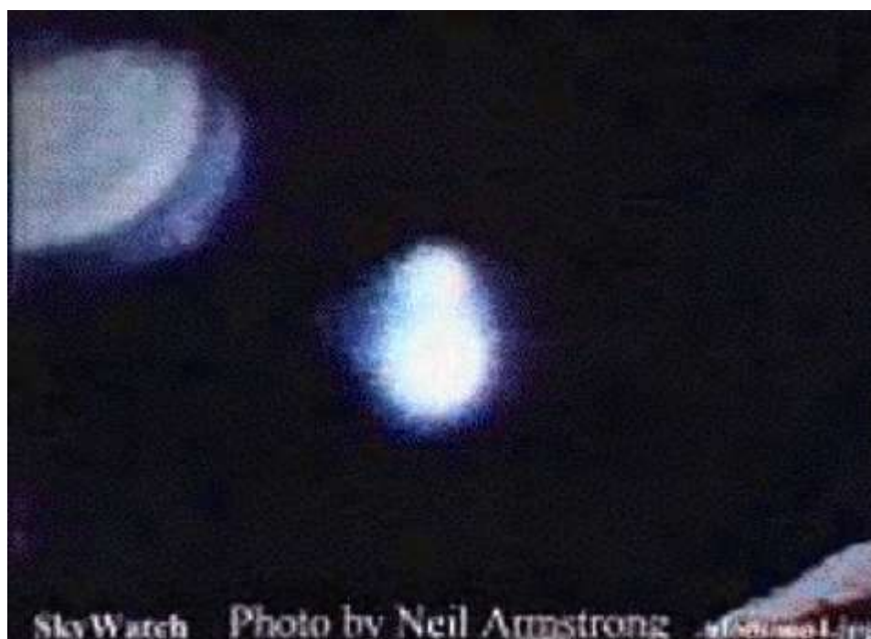
Photo of two UFO's over LEM taken by Neil Armstrong, Apollo 11 mission in 1969