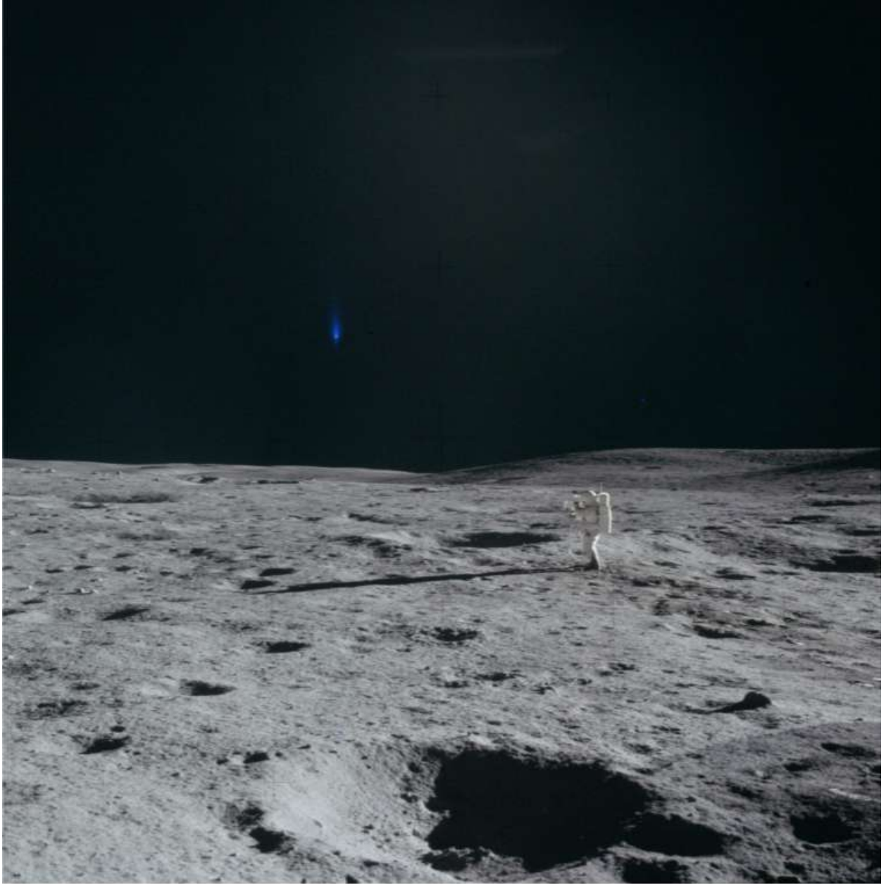
Unidentified UFO's on the moon