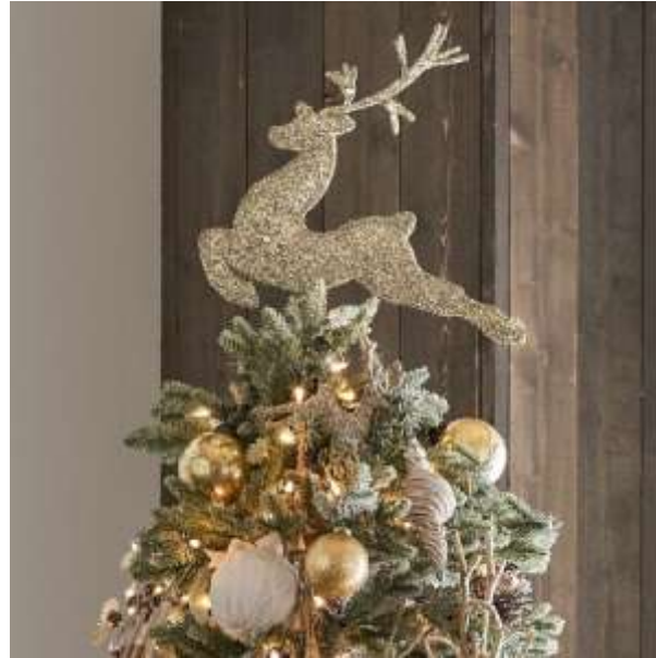
The stag atop the Christmas tree.

In Finland, the solstice meant celebrating the sun goddess Beiwe who rode on a sleigh pulled by reindeer.