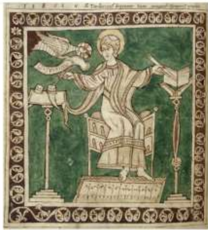
Miniature of Pope Gregory I (MS 3011, 12th century)

It is cold and wet in December in Israel. Ceasar would not have issued a decree for everyone to go and pay their taxes which would have caused many to have to travel during the coldest time of the year.