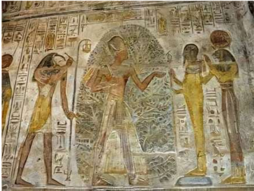
Rameses II standing at the tree.

Here is the 1923 national Christmas tree, once again we see it placed right in the vicinity of an obelisks. They represent the same thing – fertility and idolatry against God.