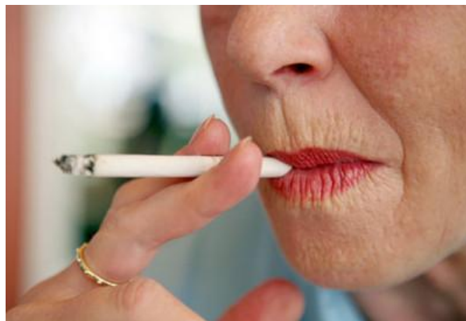
Smoking prematurely ages the lips with wrinkle lines.

I've recently seen this woman on tv commercials. The bottom picture shows her with a plug in the hole in her neck. When she talks it pops in and out. When you get to this point you sound scary. Some people have those little devices that they hold over the hole in their neck in order to talk and they sound like a robot. You don't want any of this. Usually smoking will give a woman a deeper voice.