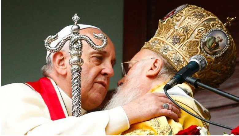
Clearly Catholic, clearly snakes.