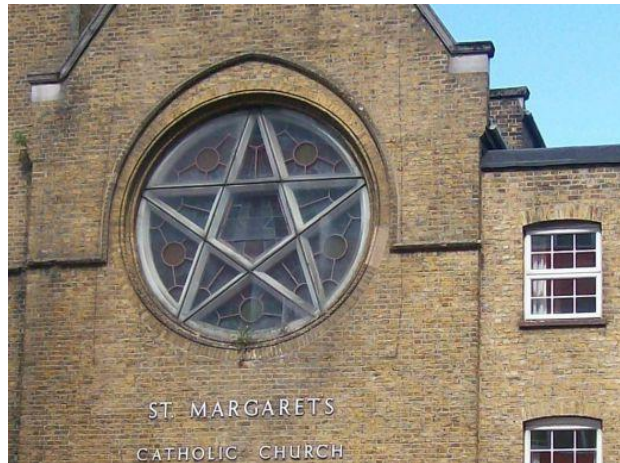
Witchcraft star in a circle. They do this type of thing a lot.