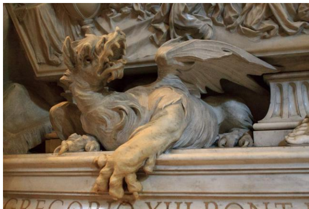
Dragon statue at Vatican Museum.

Just to be clear, here is the pope obviously fine with presenting in this building. This is what the back of the hall looks like – a snake as well.