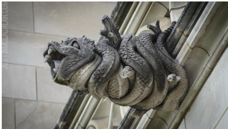
National Cathedral dragon/snake gargoyle. It has been taught that gargoyles ward off evil spirits. That is a lie. This only draws evil spirits in.