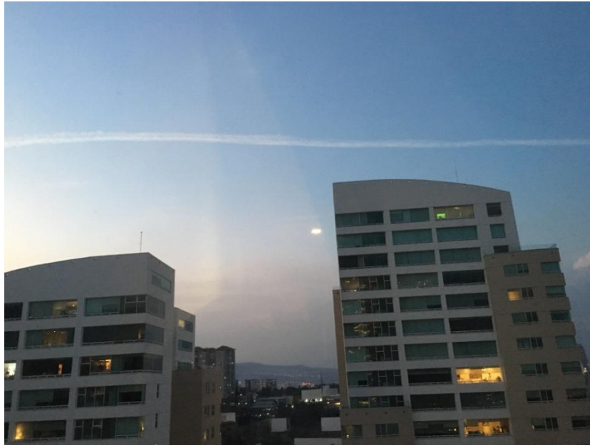
Mexico City