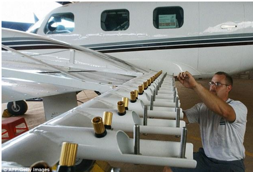
Nozzles equipped on aircraft to spray chemicals out