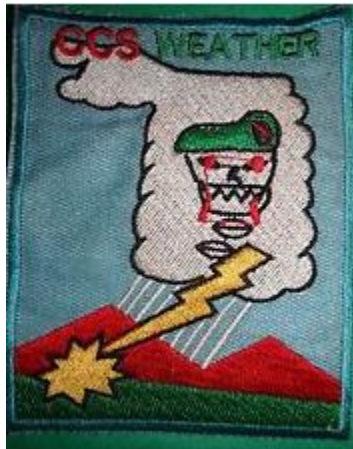
US Army 5 th Special Forces Group MACV-SOG (Military Assistance Command, Vietnam – Studies and Observations) Recon Team WEATHER CCS Patch