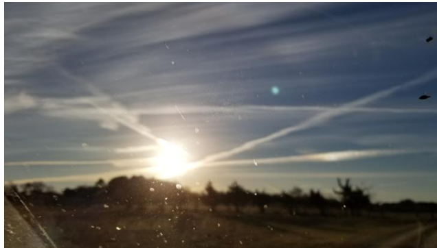
This picture was taken in Bremond, TX the population in 2016 was 943.