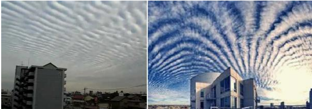
More Chemtrails L: Over Japan in 2009 R: Man made

This is not natural, not God made. Many are being fooled by things they are seeing in the skies and believe they are signs and anomalies from God, when most of it is just man made.