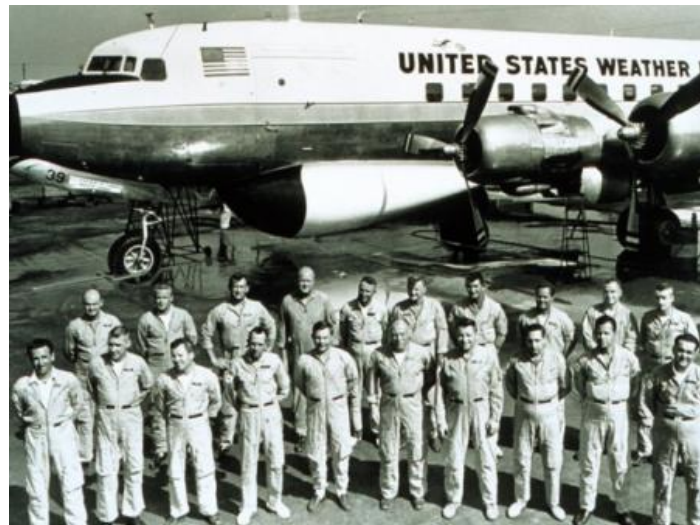
Project Storm Fury