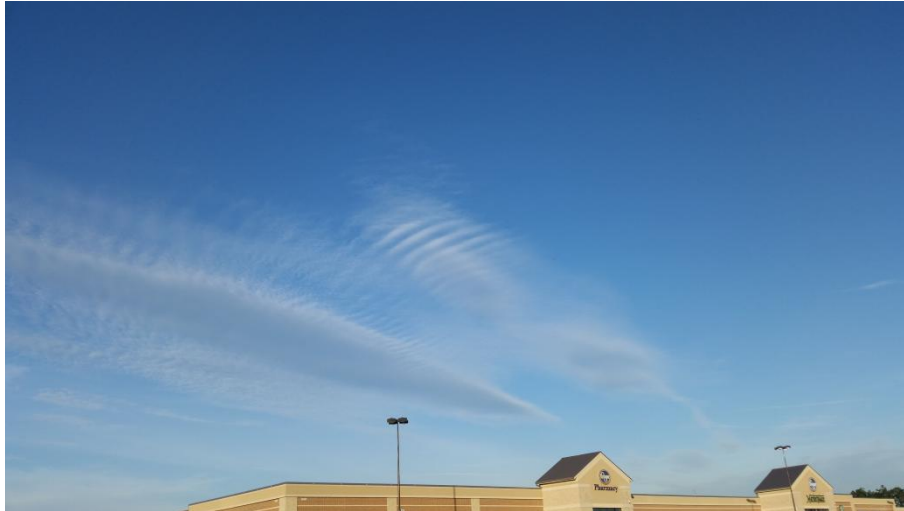
Chemtrails October 2017 at Kroger in New Caney, TX. These have had frequencies shot into or through them fanning them out