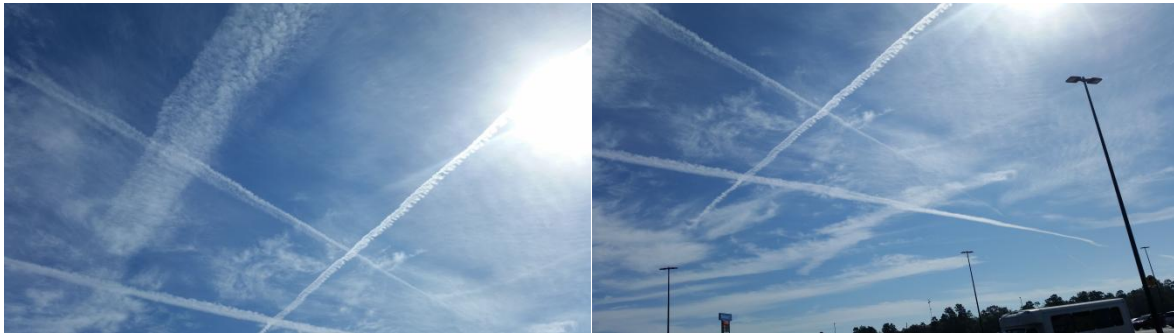
Same picture, chemtrails October 2017 New Caney, Texas

Some returning veterans from Vietnam began reporting skin rashes, cancer, psychological symptoms, birth defects in their children, and other health problems in the 1970's. In 1979, a class action lawsuit was filed against major herbicide manufacturers and was settled in 1984 out of court forming Agent Orange Settlement Fund.