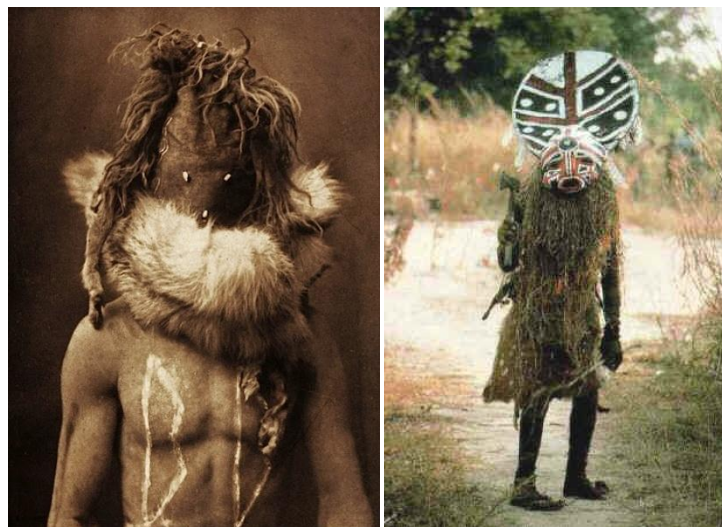
L: Indian medicine man R: shaman

Ancient priests, priestesses and shamans, used masks, animal skins, skulls and pelts of animals to create a link with and call on the powers of particular animals.