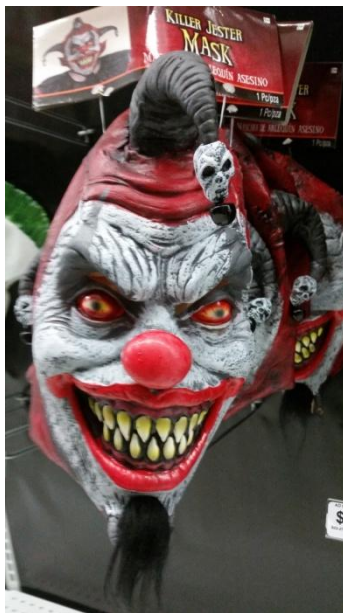
A killer jester mask. Sharp pointed demon/animal pointed teeth and demon red eyes. The color of death and the skull to represent the spirit of death.