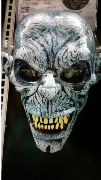
Evil creature of the night.