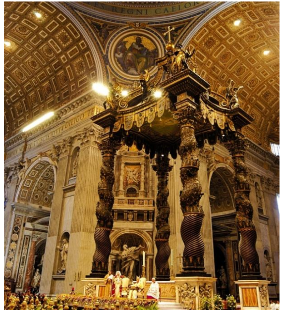
L: One type of ancient asherah pole. R: Asherah poles at the altar in the Vatican. Sun bursts are supposed to be atop each pole and I'm sure that is statues and praise to baal on top.