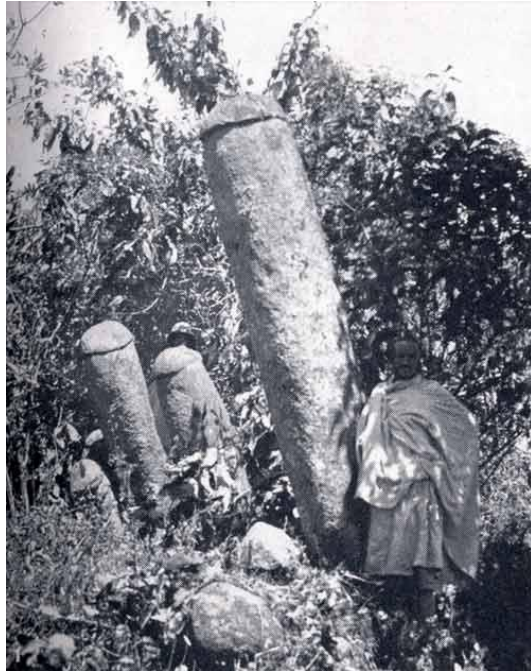
One type of asherah pole, set up in groves and representing nimrod's phallus.