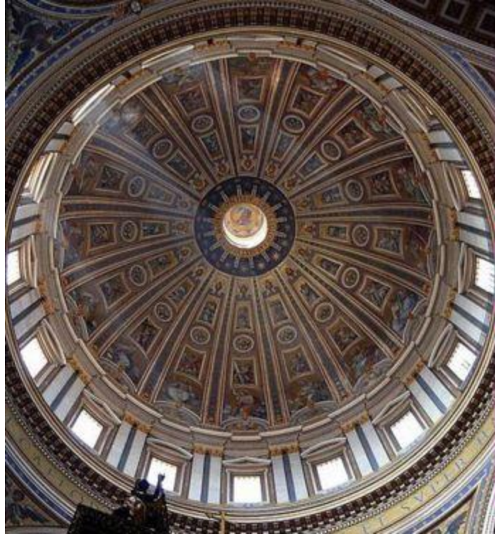
In the Vatican – sun, moon and stars.