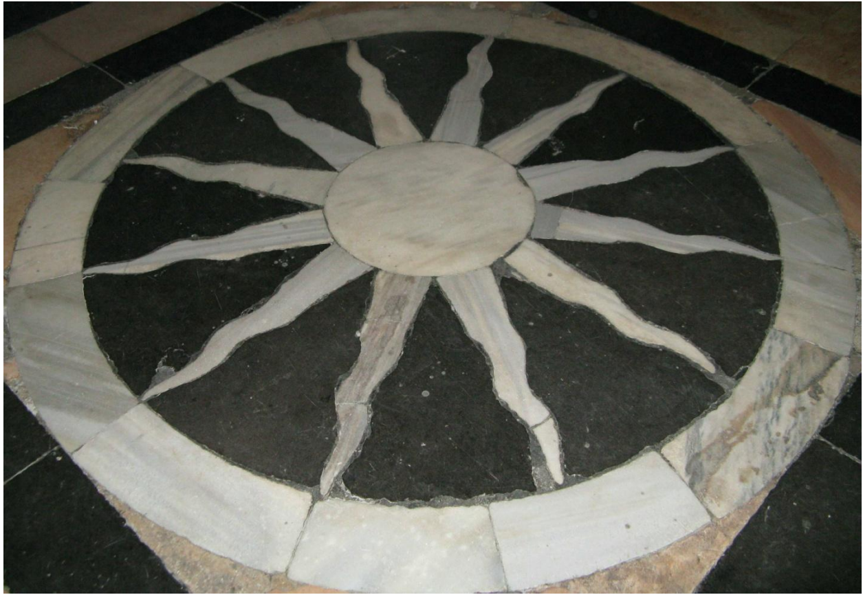
Sun worship on the floor of the church of the "holy tomb" near Golgotha.