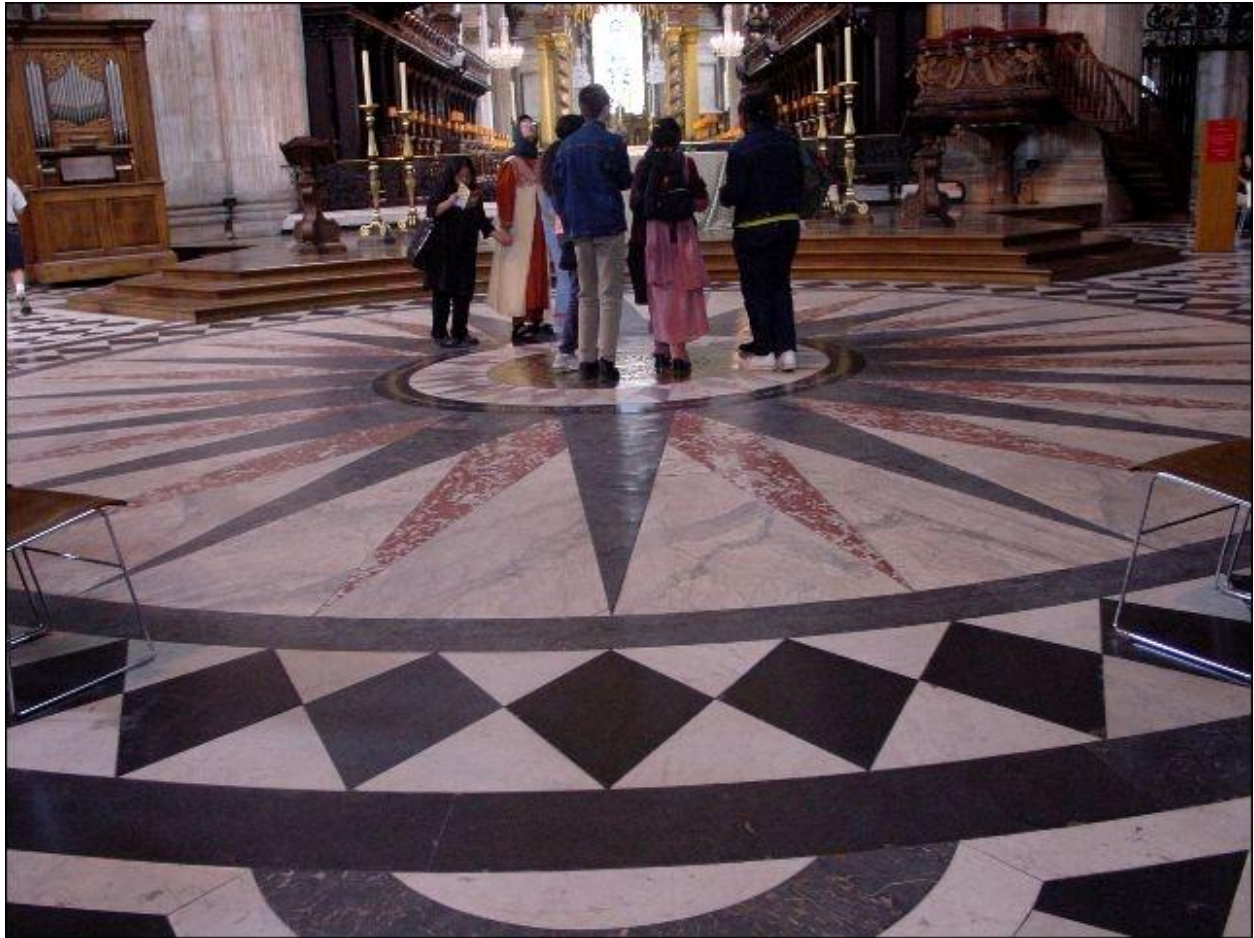
In front of the main altar in St. Paul's cathedral.