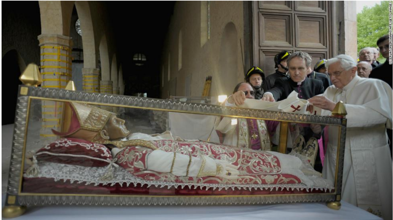
pope Celestine V