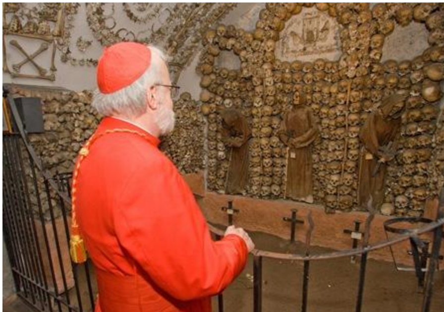
Get out of this religion that tries to say dead men's bones are holy and a thing to be praised and worshiped.