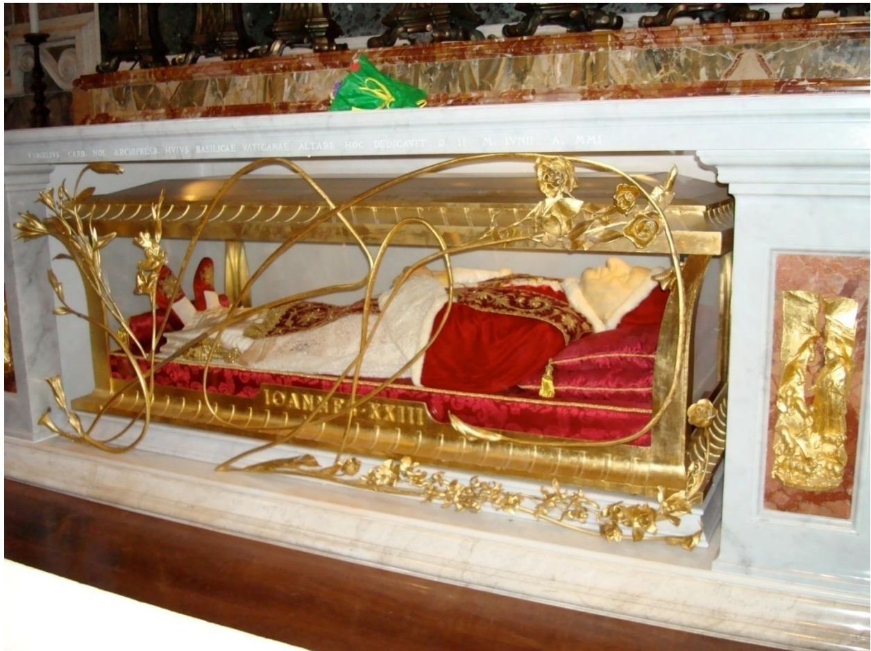
pope John XXIII

**I am about to show you some of the dead bodies and bones and skeletons that the catholic church worships. If you have small children you may want to pause the message and get them out of the room if you think this will be upsetting for them.**