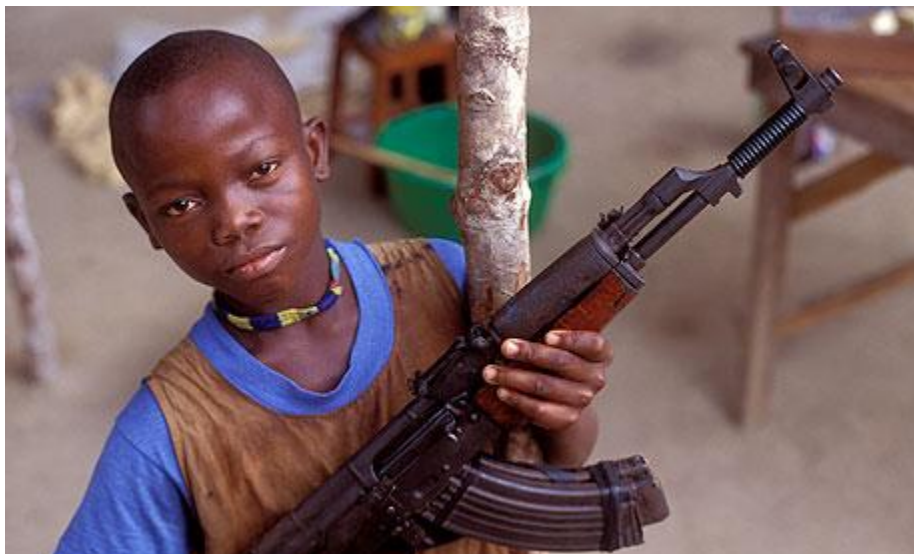
recruitment as child soldiers, (Child soldier in Sierra Leone)