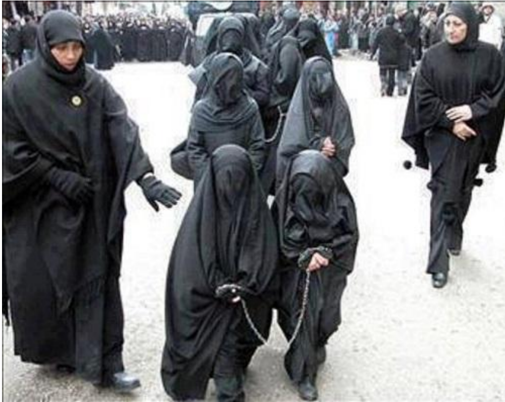
Muslim girls being lead off in chains to meet their new husbands.

Now back to child exploitation – they use children for illicit international adoption, trafficking for early marriage,