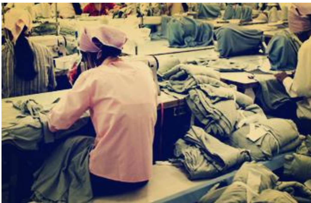
Labor Trafficking in California