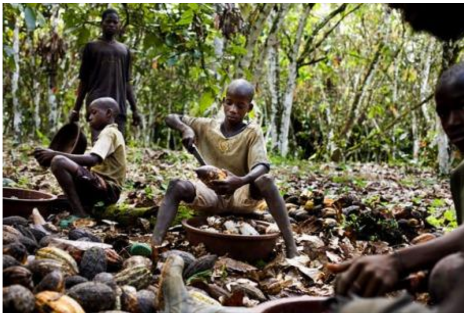
Children harvesting cocoa beans.