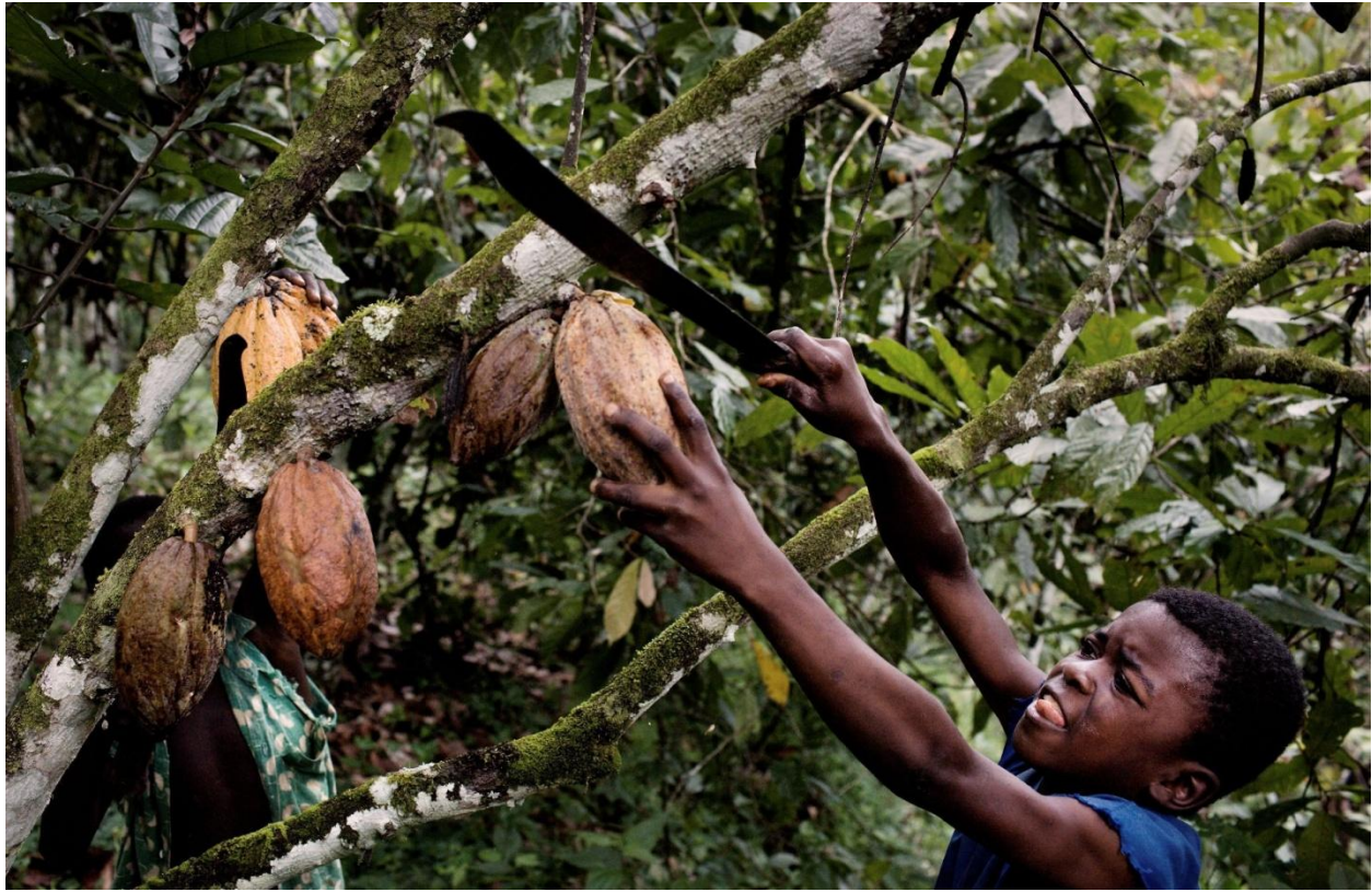
Young boy cutting pods of cocoa beans down.