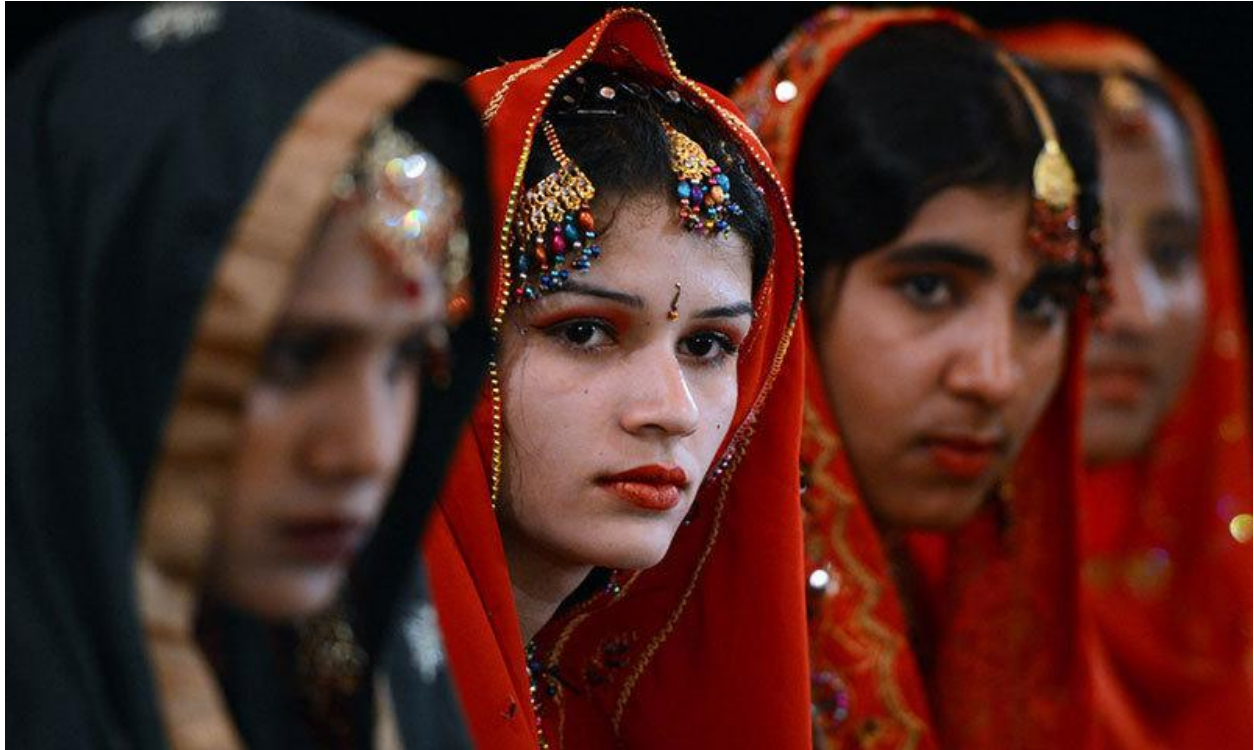
Sindh had 1,261 cases of women being kidnapped for forced marriages in 2014.