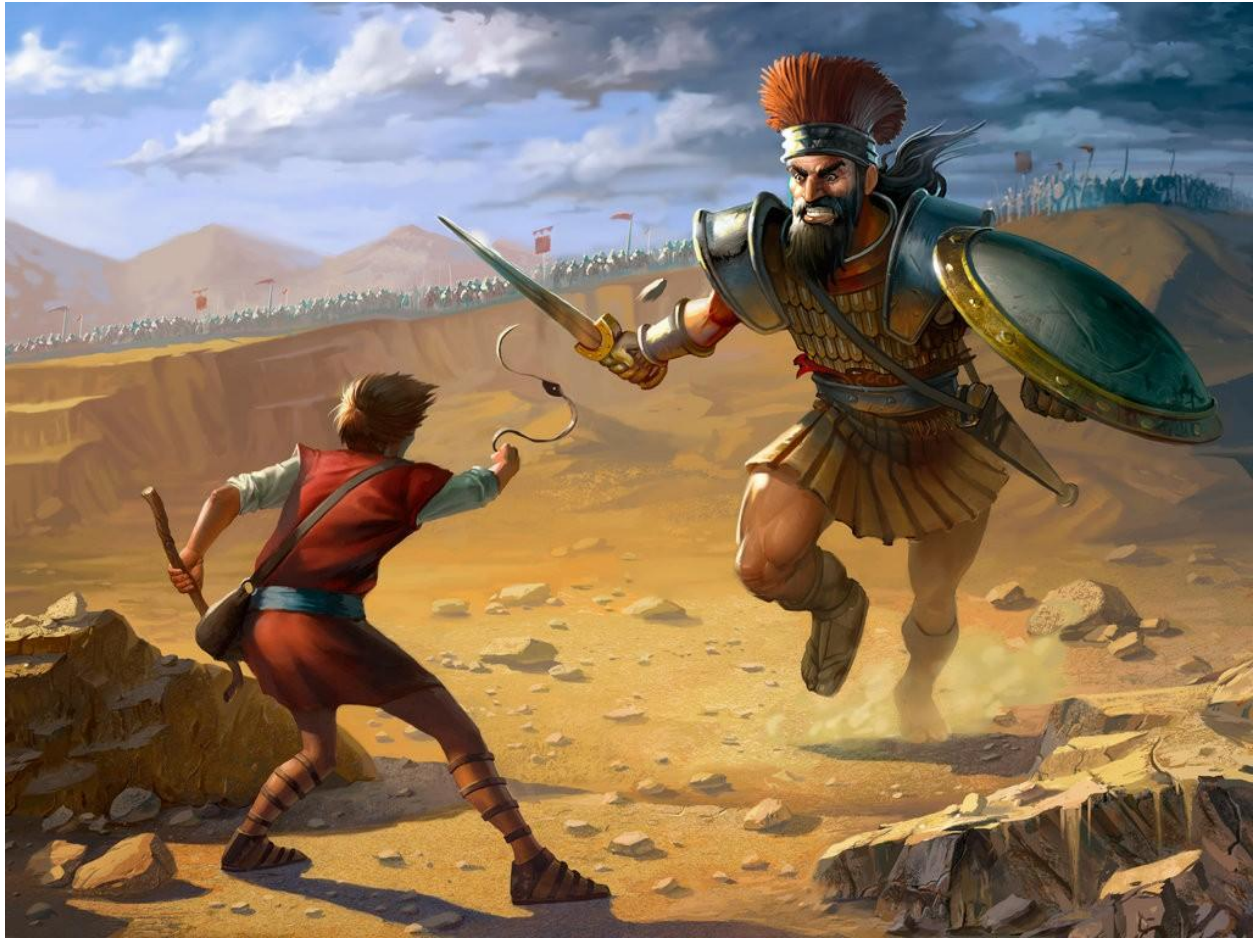
David and Goliath who was a nephilim

According to Louis Pauwells & Jacques Bergier in The Dawn of Magic (first published in France under the title " Le Matin des Magiciens " 1960 by Editions Gallimard, Paris), this was certainly the goal of the antichrist Adolf Hitler: