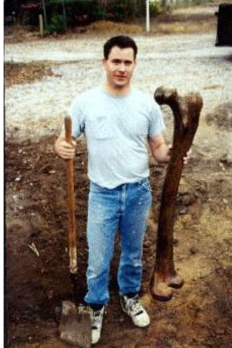
Upper thigh bone, Ohio Valley Giants

We have to understand that these nephilim / giants were prevalent in Biblical times and they wrote about what they were living and seeing and battling. Today, these nephilim / giants are still here. I hope to bring this out so that we can realize this as this message progresses.