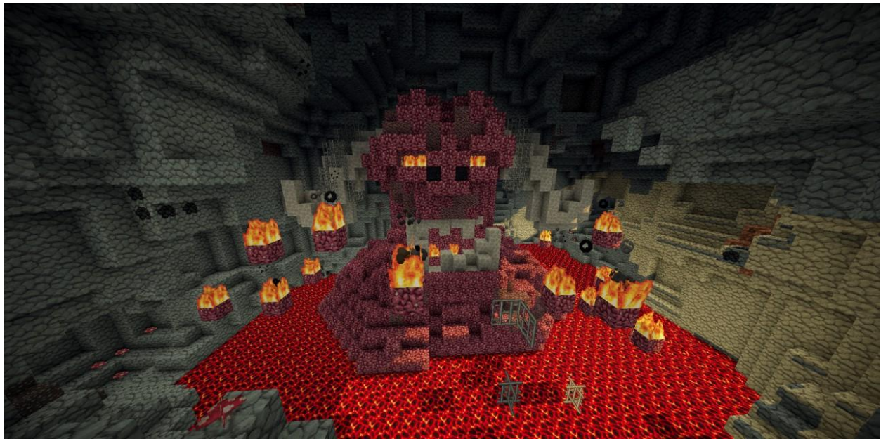
Suicide Island, satan's nest = HELL