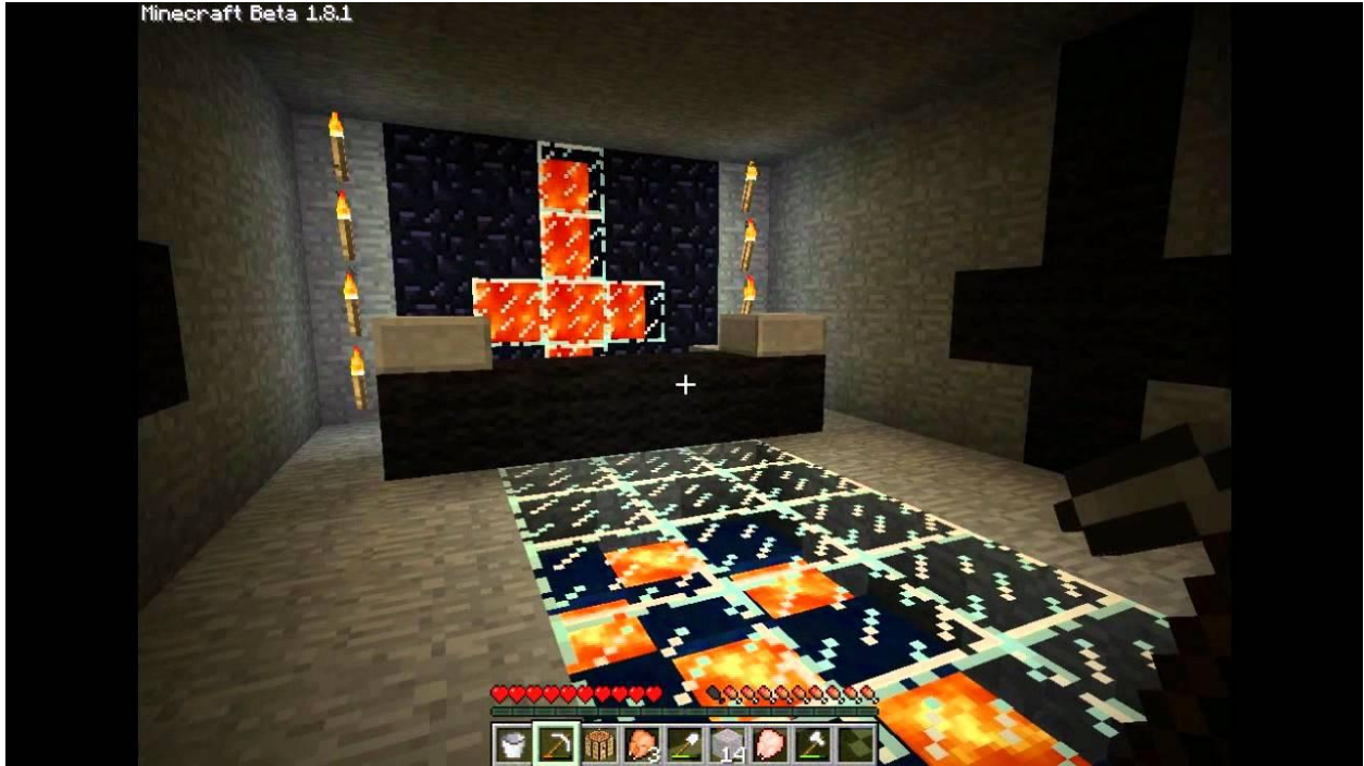
Minecraft hidden satanic alter