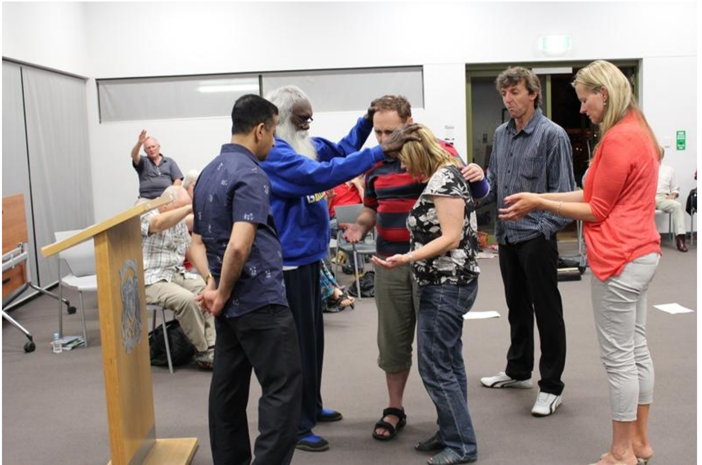
Indigenous Pastor laying hands on

It is interesting that the end of the verse says not to be partaker of other men's sins and to keep yourself pure. If you are not a strong Christian with a sincere walk with the Lord, you can leave yourself open for attacks of the enemy through the laying on of hands by people who do not serve the Lord, but serve satan and by people who possessed and oppressed d by demons. That is what we are seeing in our churches. The hands are laid on and people begin to roar like a lion and bark like a dog and flop on the floor looking as if they are convulsing from a seizure. Some scream, laugh uncontrollably and some shake their heads violently or cannot control their bodies. Some instantly look drunk and slump down in their chair and just fall on the floor. One person was trying to preach on hell and everyone was laughing and laughing and laughing. I can assure you that is not God doing that. The devil loves for hell not to be preached on and to distract from God's Truth. Some people were trying to tear their clothes off and kicking down microphone stands and climbing on chairs and raising legs and head at same time and did not look natural at all. The leaders were going around kicking at people and acting like they were imparting anointing by kicking at the people while the people fell down. We have all seen some wave their hand and the