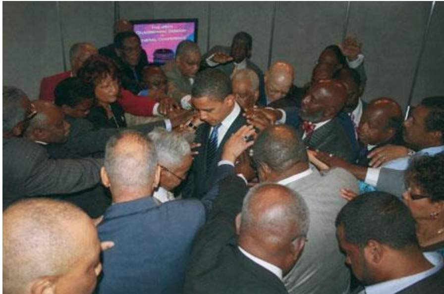
Laying hands on Obama

crowd fall back or fall down. Many times in churches where we are seeing this unnatural activity it is demonic. Mark 9:20-23 – And they brought him unto Him: and when He saw Him, straightway the spirit tare him; and he fell on the ground, and wallowed foaming. And He asked his father, how long is it ago since this came unto him? And he said, Of a child. And ofttimes it hath cast him into the fire, and into the waters, to destroy him: but if thou canst do anything, have compassion on us, and help us. Much of what I described above is totally demonic and nothing to do with the Holy Spirit. Remember satan's deception will so closely resemble the things of God that he will deceive the whole world. (Rev.12:9)