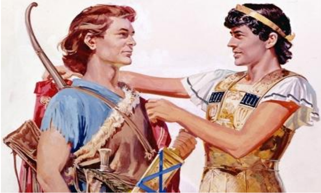
King David and Johnathan

King David was a man after God's own heart. He will rule and reign very soon again in Jerusalem under Jesus. Most men do not have loving sincere relationships that are pure like the one they had. Most of this is due to the world falling into sin. But the Bible is very explicit when it needs to be and holds nothing back. You can read of a woman being raped all night and left for dead (Judges chapters 19 & 20). You can hear of a man not wanting to impregnate a woman in Genesis 38:7-10. The Bible speaks of letting your wife's breasts satisfy you in Proverbs 5:19. The Book of Solomon describes his bride's features. A woman's period is discussed in the Bible (Lev.15:19). So let's not kid ourselves, if King David and Jonathan were gay, the Bible would have clearly stated that.